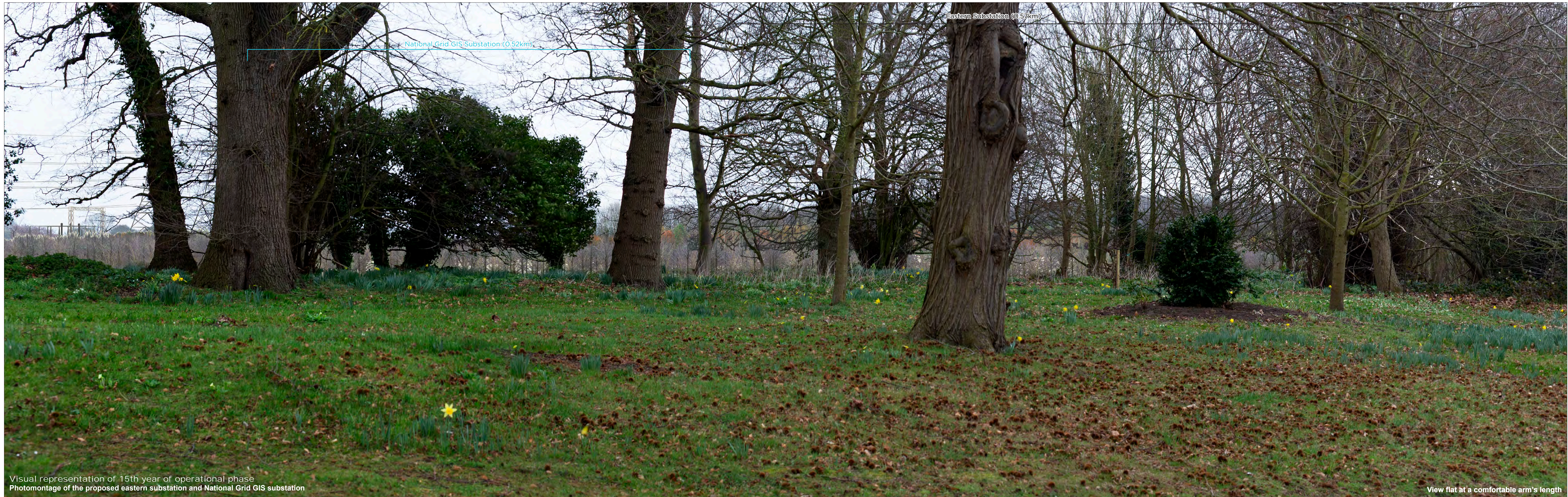
Visual representation of 15th year of operational phase Photomontage of the proposed eastern substation and National Grid GIS substation