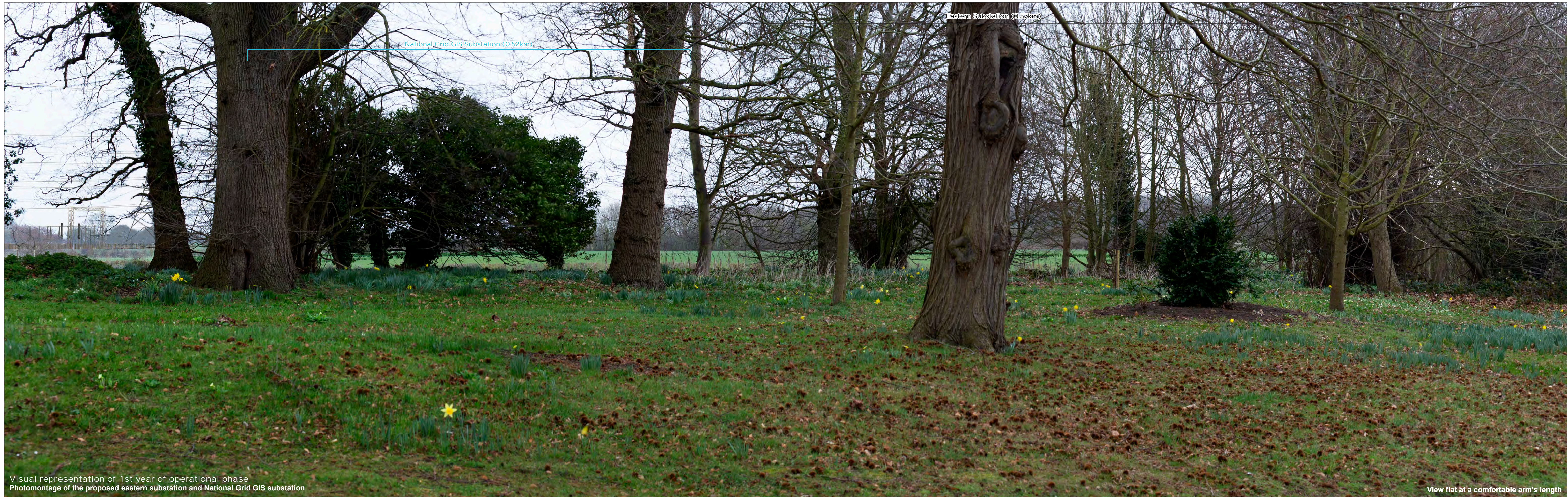
Visual representation of 1st year of operational phase Photomontage of the proposed eastern substation and National Grid GIS substation