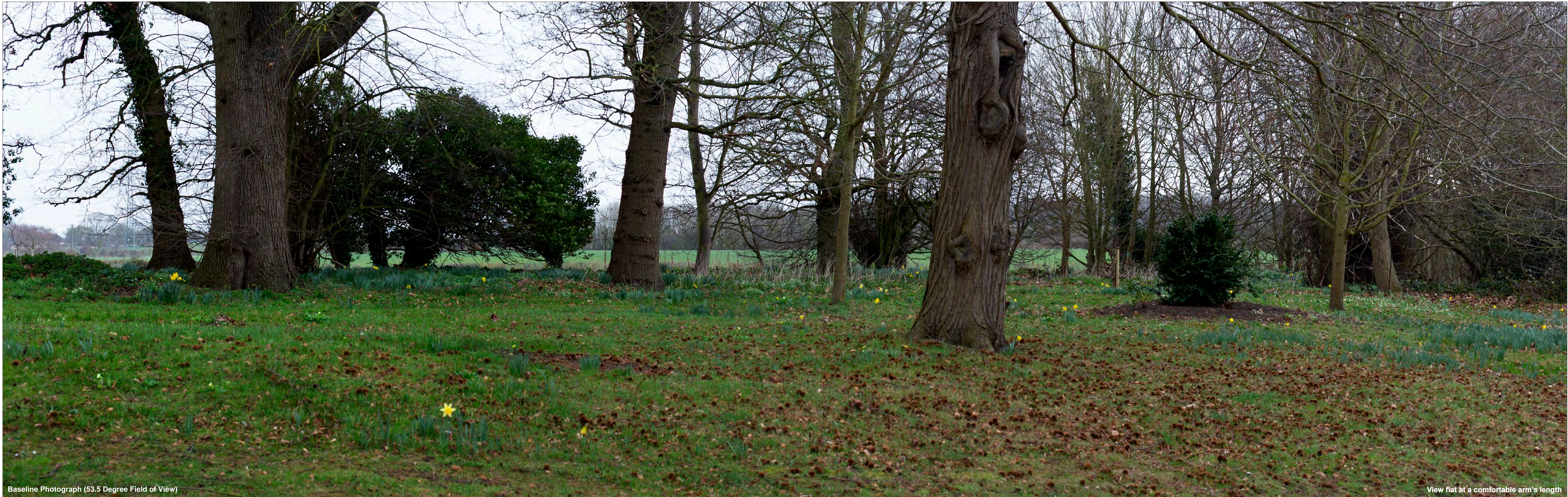
Baseline Photograph (53.5 Degree Field of View)