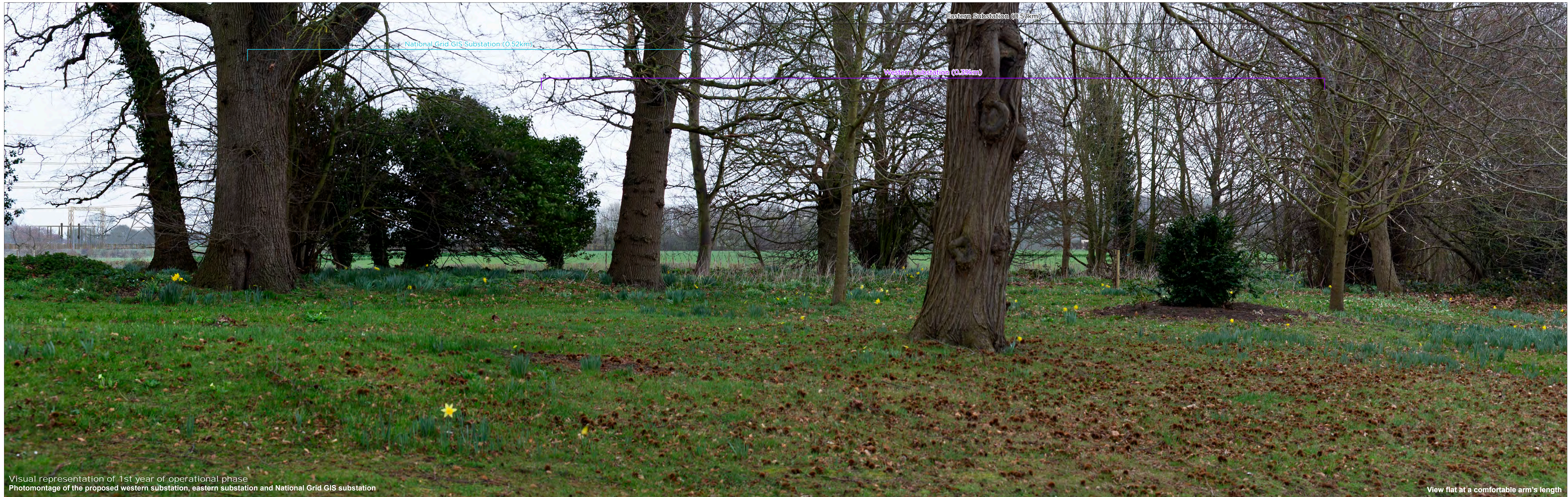
Visual representation of 1st year of operational phase Photomontage of the proposed western substation, eastern substation and National Grid GIS substation