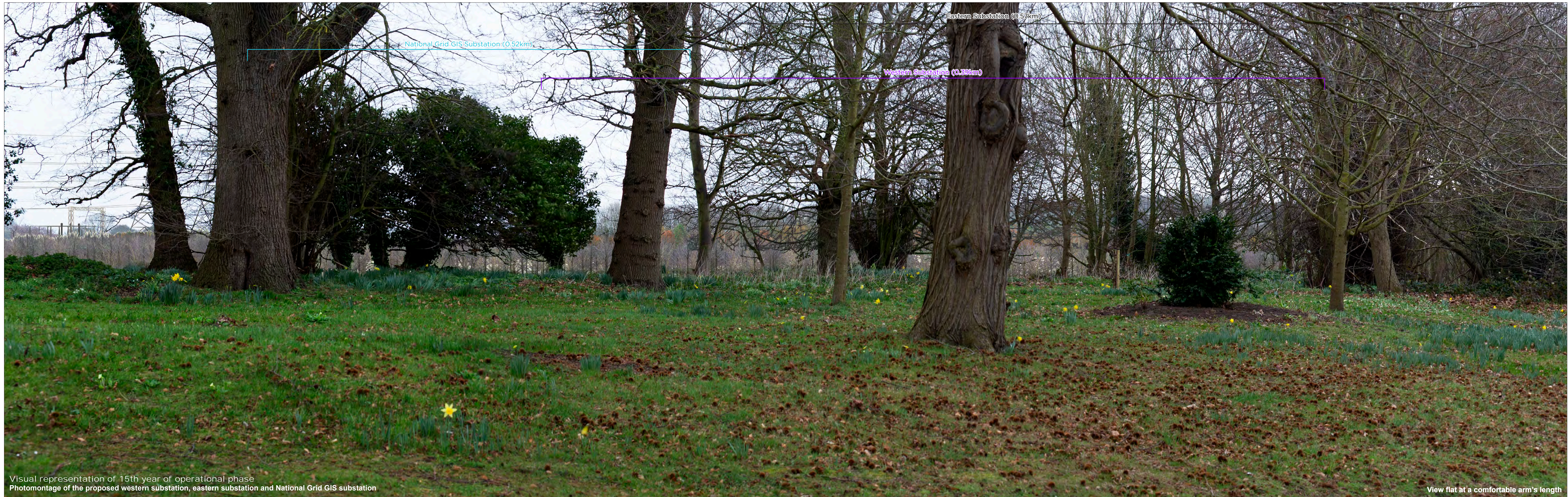
Visual representation of 15th year of operational phase Photomontage of the proposed western substation, eastern substation and National Grid GIS substation